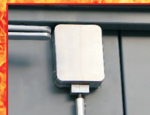
Two-point Heavy-duty Latches