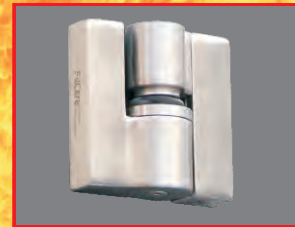
IP65 Rated Dust&Water Proof Heavy-duty Bearing Hinges