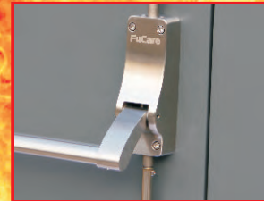
Self-lubricating Heavy-duty Panic Bar